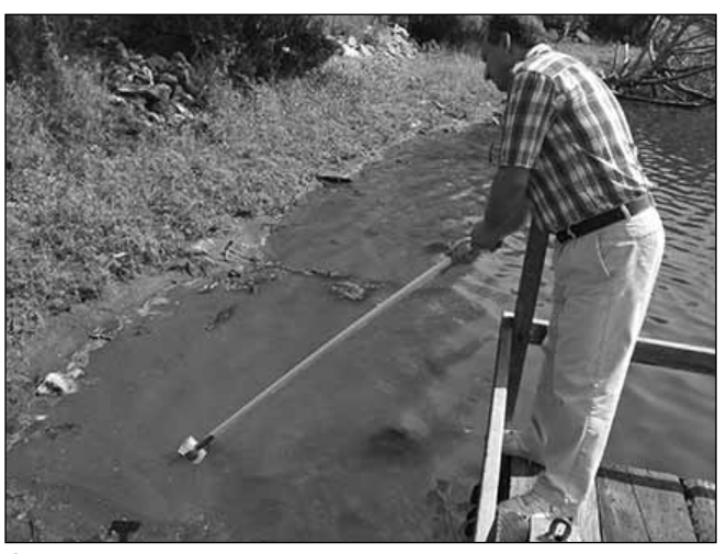
Shorelines where algae collect are a good location to collect a water sample. Use care not to let the water contact exposed skin while sampling.