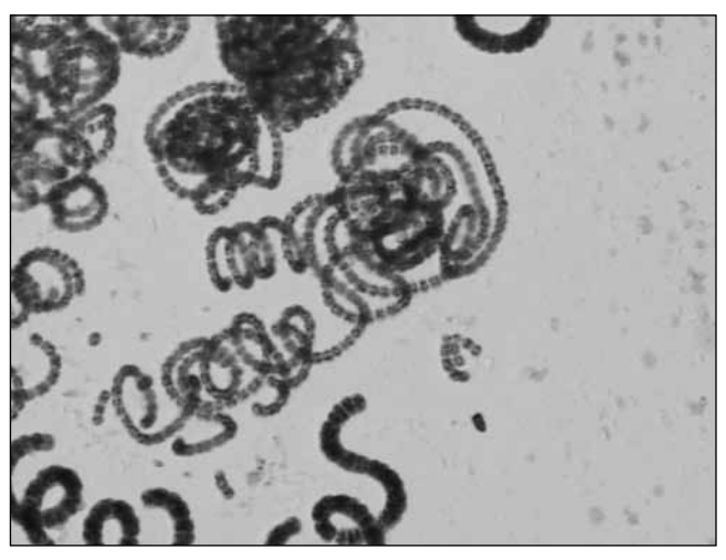
A toxic species of blue-green algae in the genus Anabaena.