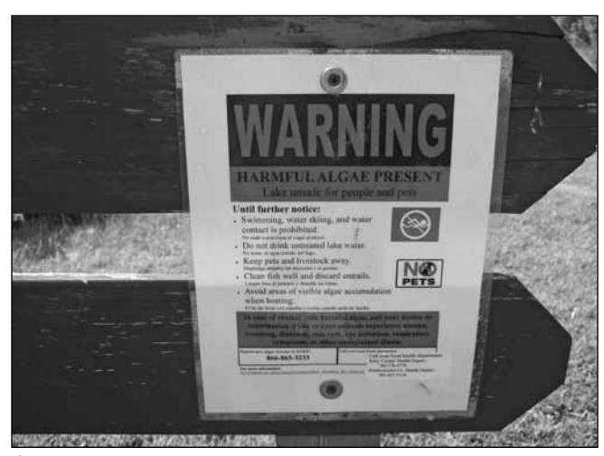
Signs may be posted at lakes or ponds where blue-green algae have been found. Do not assume a body of water without a warning sign is safe.

The duration of harmful algal blooms is difficult to predict and is influenced by weather conditions. The condition may last from days to months. Cooler, cloudy weather with high wind speeds generally shortens the duration. Before allowing livestock to drink water from a pond that was previously determined to have a harmful algal bloom, another water test should be