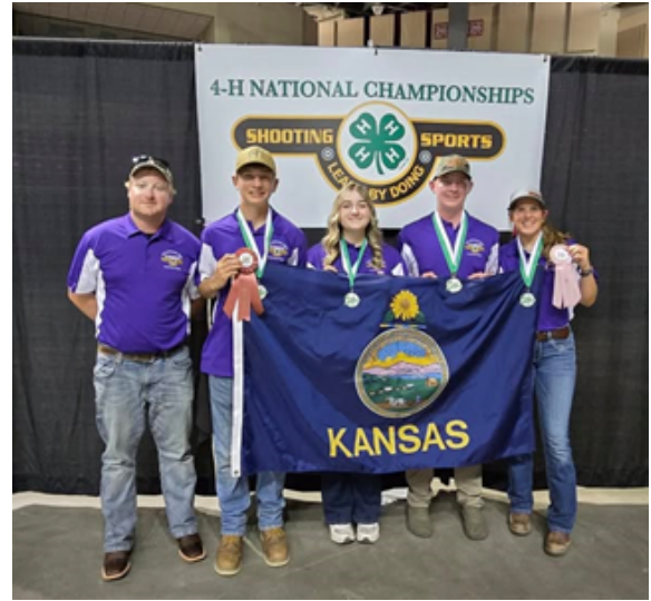
Kansas National Team

Sedgwick County 4-H Super Shooters showing citizenship at nationals. They were the only team that helped break down the range. 1st Place in my book. Hope you are all having fun.