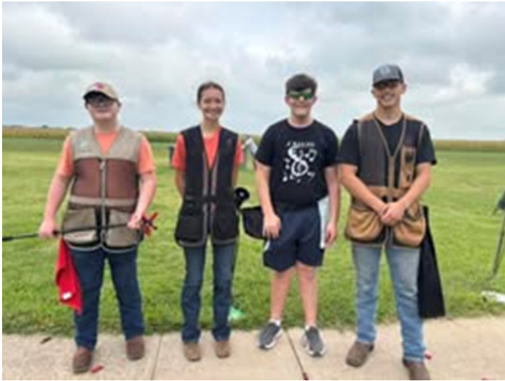
State Qualifiers for Shotgun